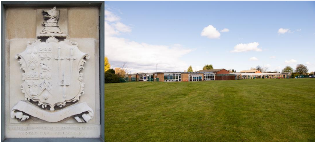
Werrington Primary School Crest and playing field

Werrington is a 'village' on the edge of Werrington township, dating back to Norman times and is within the City of Peterborough. The school is situated in the centre of the village and is surrounded for the most part by private housing.