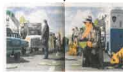
Chief Constable inspecting one of the numerous lily pads.

Overnight, confused residents have woken up to find hundreds of lily pads on washing lines, roads, in gardens and more.